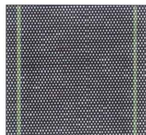
B/W The perfect reflection